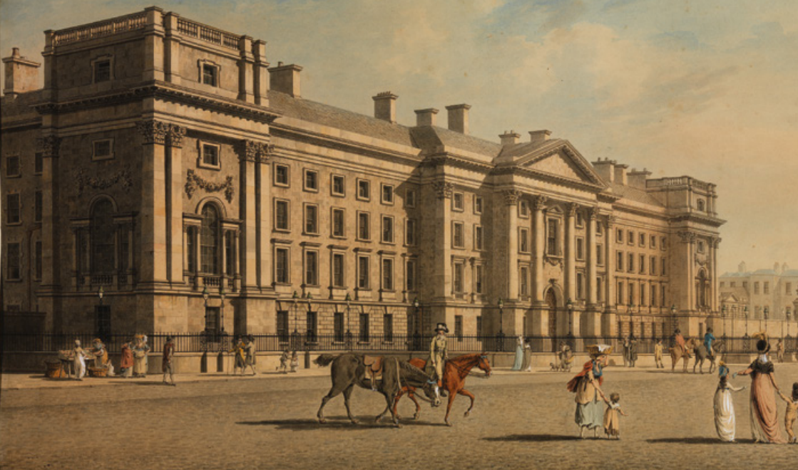
James Malton (1761-1803), Trinity College, College Green Dublin, 1796 (detail).