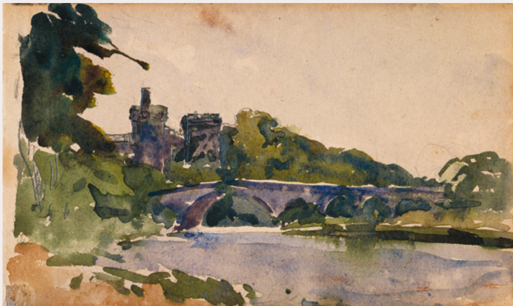
Nathaniel Hone the Younger (1831-1917), Lismore Castle and River Blackwater, 1902.

Very limited spaces Early booking advised