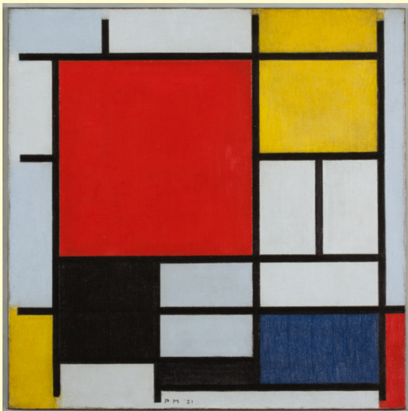
Piet Mondrian (1872–1944), Composition with large red plane, yellow, black, gray and blue , 1921.