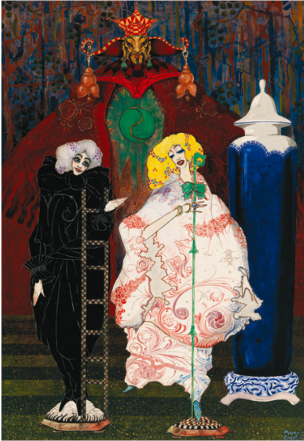
Harry Clarke (1889-1931), The Shepherdess and the Chimney Sweeper.