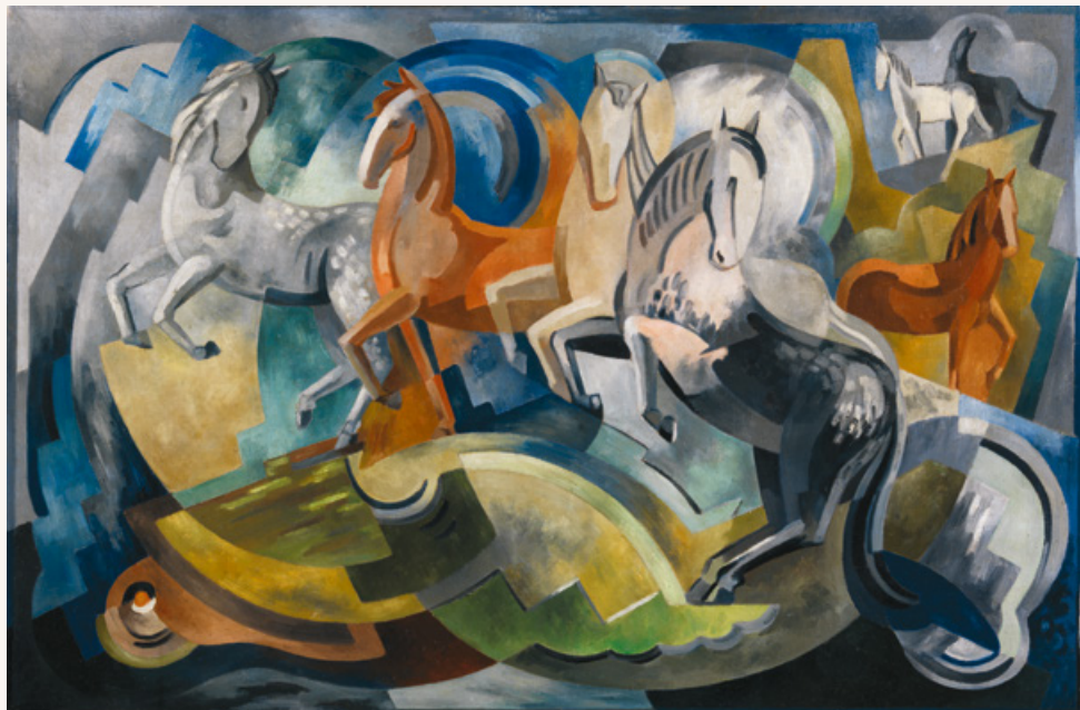
Mainie Jellett (1897-1944), Achill Horses, 1941 (detail).