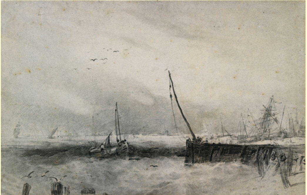
William Mulready (1786-1863), Vessels in a Squall off the Coast, 19th century.