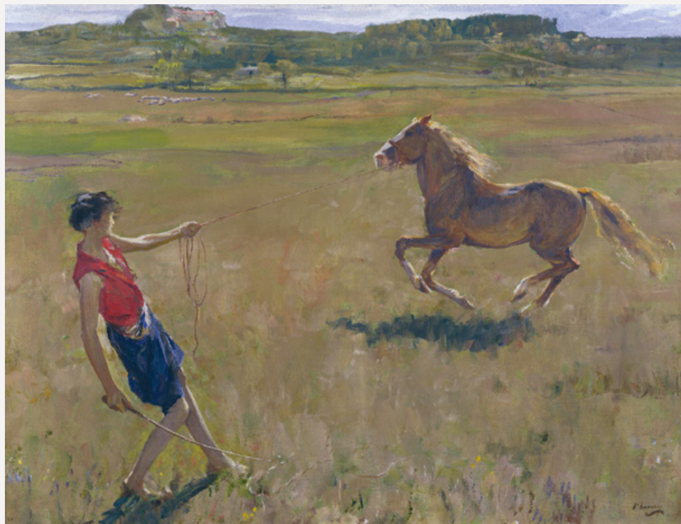
John Lavery, (1856-1941), Schooling the Pony. Lent by Touchstones Rochdale Art Gallery, Link4Life.