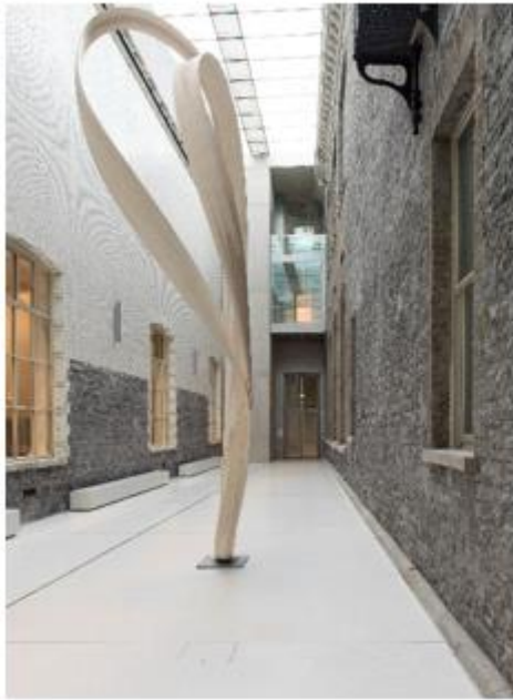
Joseph Walsh (b.1979) Magnus Modus, 2017 Olive ash, white oil finish, base: Kilkenny limestone H 7450mm x W 265mm x D 17750mm

The Courtyard was created by architects Heneghan Peng as part of the refurbishment project of the historic wings. Situated between the 1864 Dargan wing and the 1903 Milltown wing on Merrion Square, the Courtyard is the perfect light-filled venue for a reception or networking event.