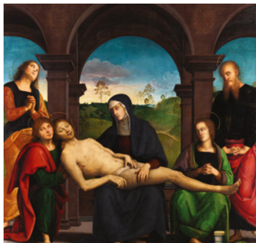
Perugino, (c.1450-1523), The Lamentation over the Dead Christ c.1495