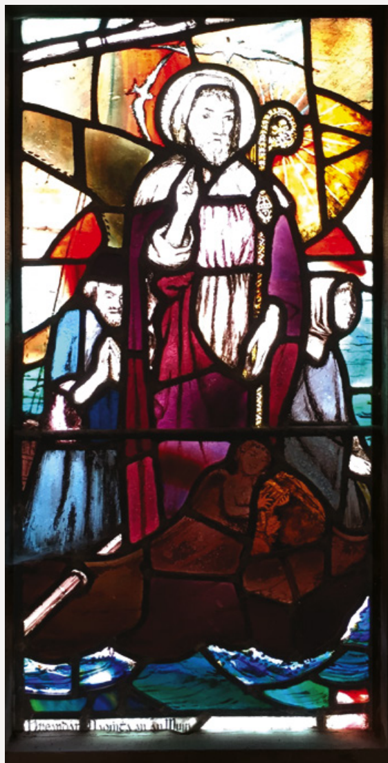
Sarah Purser, (1848-1943), Saint Brendan the Navigator , 1903