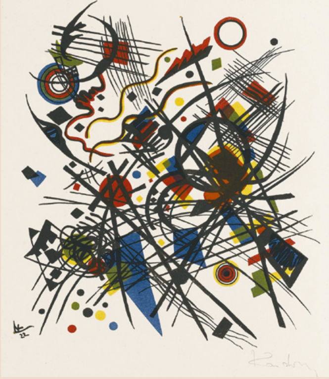
Wassily Kandinsky (1866-1944), Composition, 1922.