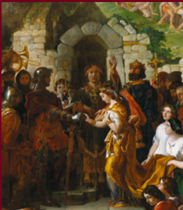
Daniel Maclise (1806- 1870) The Marriage of Strongbow and Aoife (1854), detail.