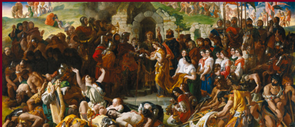
Daniel Maclise (1806- 1870) The Marriage of Strongbow and Aoife (1854), (detail).

3 nights — Tuesday 24 - Friday 27 September