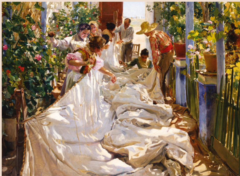
Ca'Pesaro Venice, Sewing the Sail (Cucendo la vela) , 1896