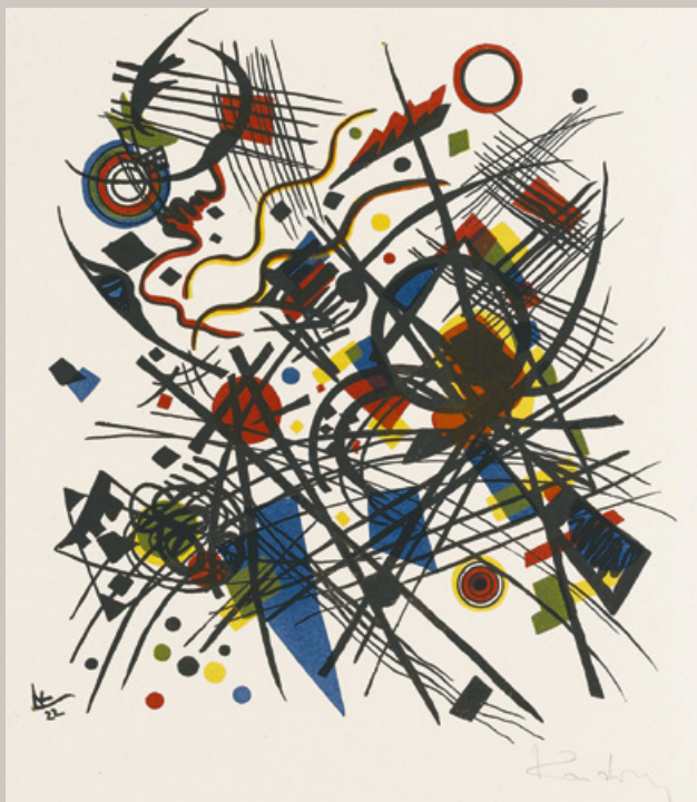
Wassily Kandinsky (1866-1944), Composition, 1922.