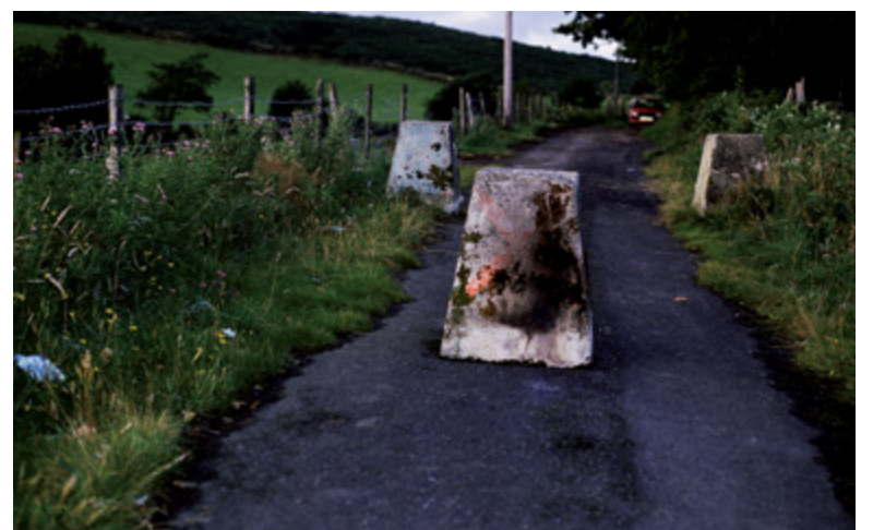
▲ Image (Top): Martin Gale, b.1949, Over and Above , 2017 (Detail)