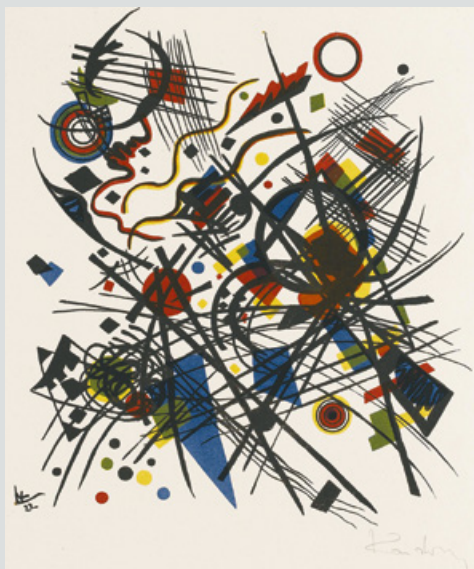
Wassily Kandinsky (1866-1944), Composition, 1922.

Book your place online at nationalgallery.ie/events-friends .