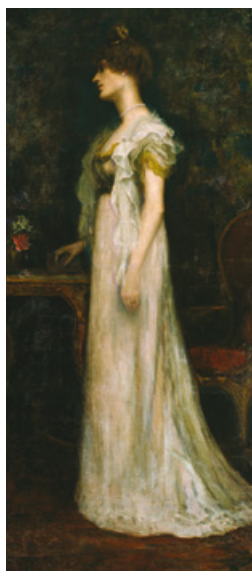
Casimir Dunin Markievicz, (1874-1932) The Artist's Wife, Constance, Comtesse de Markievicz (1868-1927), Irish Painter and Revolutionary, 1899

11:00 Meet in the Members' Room, No. 5 South Leinster Street 13:00 Ends Ticket €25