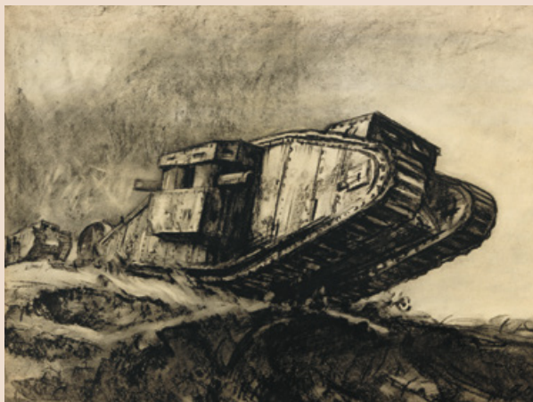
Tanks by Muirhead Bone

Published by authority of the War Office by Country Life, 1917