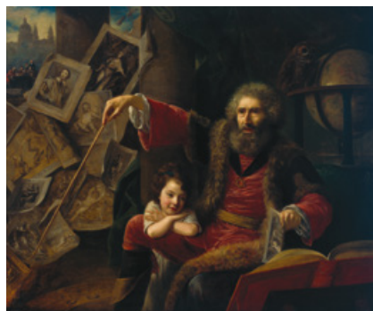
Nathaniel Hone the Elder, (1718-1784) The Conjuror , 1775 NGI Purchased, 1966 (Shaw Fund)

(depart Gatwick 19:20, arrive Dublin 20:40)