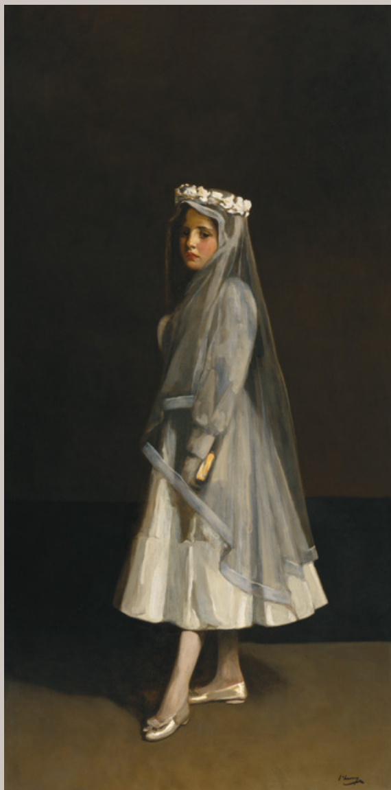
John Lavery, 1856-1941, Her First Communion , 1902 Purchased with the support of the Friends of the National Gallery of Ireland, 2018

Your support makes a difference. Thanks to our members we have contributed to a major acquisition for the National Gallery of Ireland, John Lavery's Her First Communion .