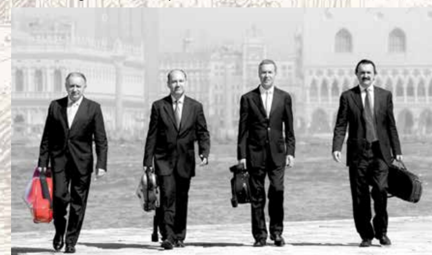
Il Quartetto di Venezia

As part of our February Thursday Lates event, enjoy an engaging concert featuring the music of Boccherini, Mozart, Malipiero and Cherubini, performed by the Italian Il Quartetto di Venezia in the beautiful surroundings of the Gallery's Shaw Room.