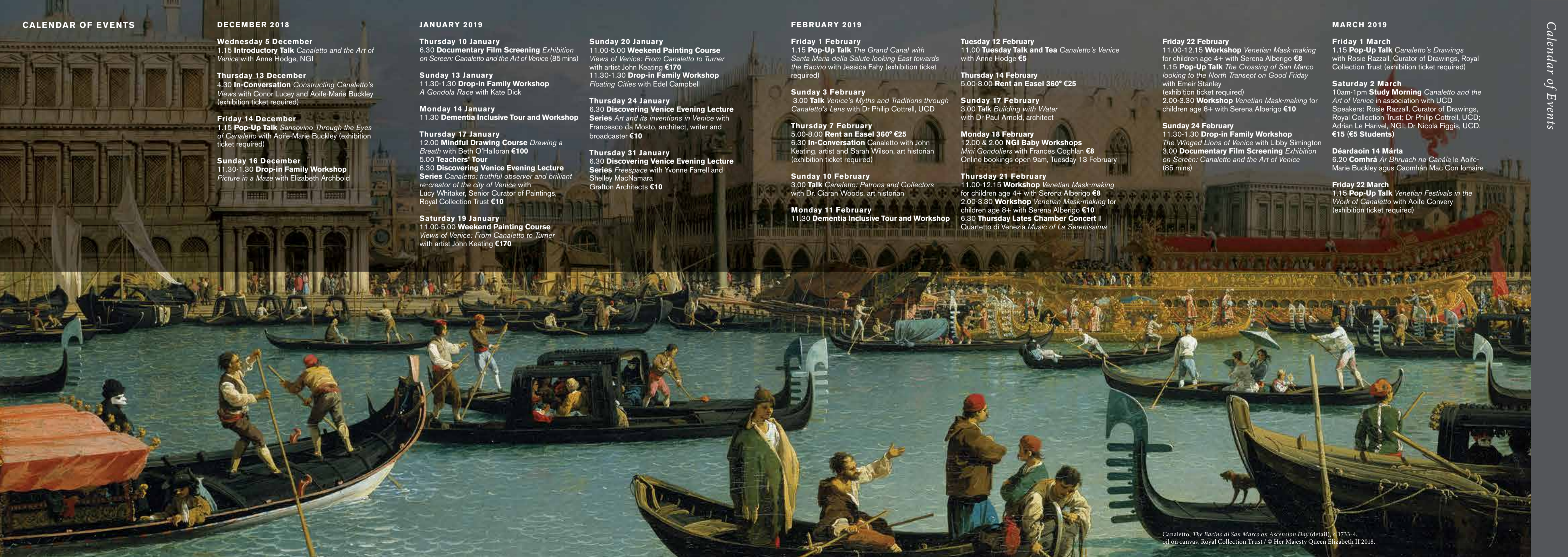
Canaletto, The Bacino di San Marco on Ascension Day (detail), c.1733-4, oil on canvas, Royal Collection Trust / © Her Majesty Queen Elizabeth II 2018.