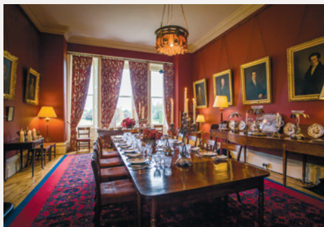
Clonalis House interior

Join us on a private tour of Clonalis House, Castlerea, Co. Roscommon where we will explore the magnificent Victorian mansion, still owned by the O'Connor family who are direct descendants of the last High Kings of Ireland. Built in 1878, the house features a large collection of fascinating family portraits, a vast library, an archive containing over 100,000 manuscripts, some of which date to the 16th century and a private chapel. To tie in with the Gallery's Roderic O'Connor exhibition, we will also learn about the link between Clonalis and Roderic O'Connor's family. A private 2-course lunch followed by tea or coffee will be enjoyed in the house.