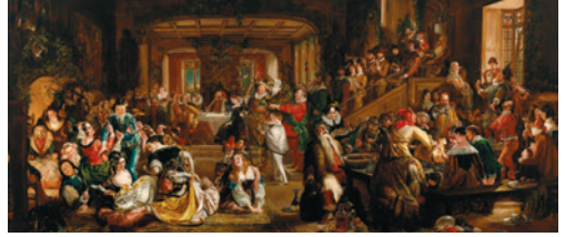
Daniel Maclise, (1806-1870), Merry Christmas in the Baron's Hall , 1838

Christmas dinner and musical performance - The Baron's Banquet Friday 30 November