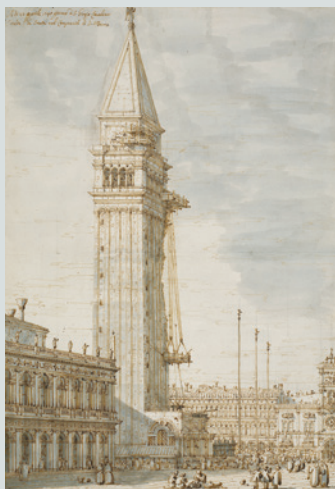
Canaletto, 1697 - 1768 The Campanile under Repair, c.1745