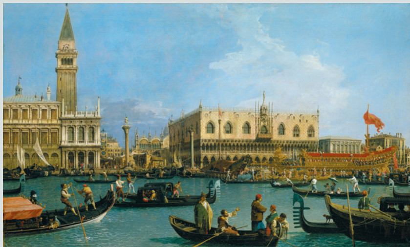
Canaletto, 1697 - 1768 The Bacino of San Marco on Ascension Day, c.1733