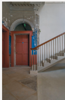
Image: Interior 14 Henrietta St.

Book your place online at nationalgallery.ie/events-friends