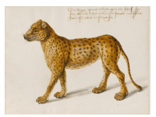
Frans Post (1612–1680) Jaguar, Watercolour and gouache, with pen and black ink, over graphite

In anticipation of Curious Creatures: Frans Post and Brazil, exhibition curator, Niamh MacNally will delve into the work of the Haarlem-born artist, who, in 1636, accompanied Johan Maurits, Count of Nassau-Siegen, on his exceptional expedition to the New World. Post spent seven years in Brazil, depicting the landscape and drawing the exotic flora and fauna. The country continued to inspire him after his return to the Netherlands in 1644.