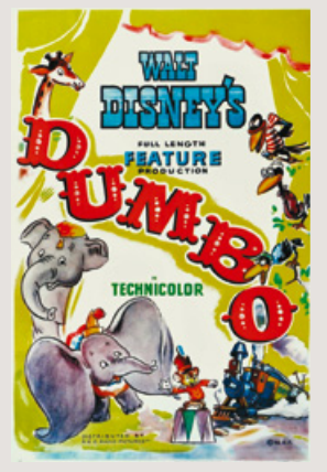
Dumbo Sunday 22 July 15:00 Gallery lecture theatre Film run time 64 minutes. Ticket price: Free

Open to members and non-members. Screenings in association with Access Cinema. Book your place online at nationalgallery.ie/events-friends .