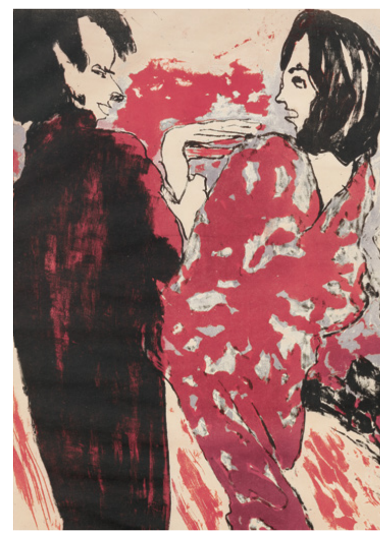
Emil Nolde, Young Couple, 1913 (Detail), © Nolde Stiftung Seebüll.