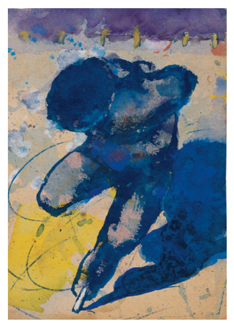
Emil Nolde, Skater, 1930s-40s (Detail), © Nolde Stiftung Seebüll.

For further information: nationalgallery.ie education@ngi.ie