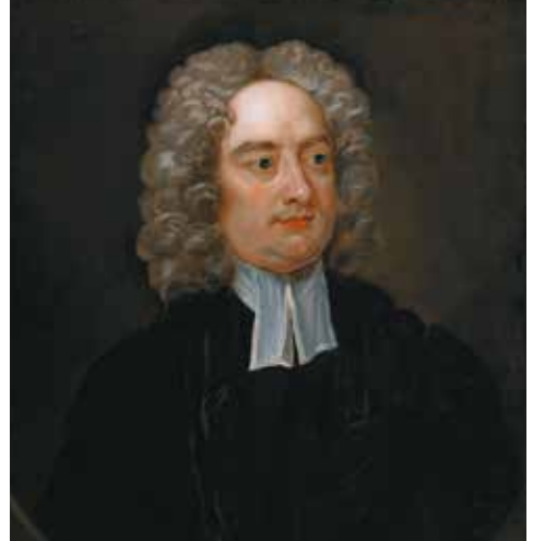
Studio of Charles Jervas, Portrait of Jonathan Swift (1667 - 1745), Satirist, 1709/16