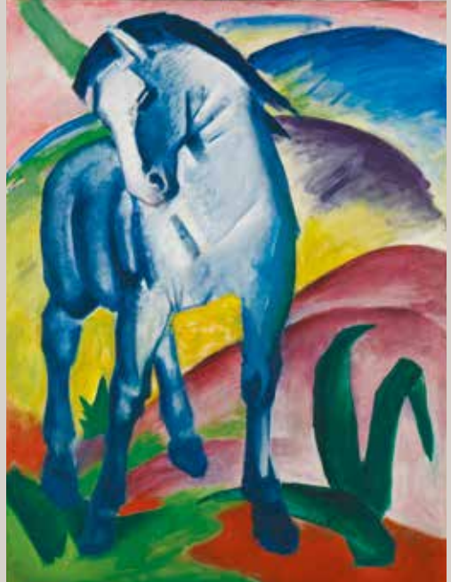
Franz Marc, Blaues Pferd I , 1911, Lenbachhaus