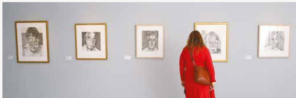
IMMA Collection: Freud Project, 2016 – 2021, Installation view IMMA – Irish Museum of Modern Art, Freud Centre, Dublin.