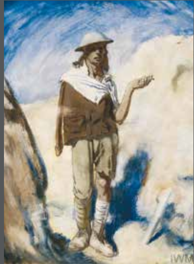
William Orpen (1878-1931), Man with a Cigarette, 1917

Book your place online at nationalgallery.ie/events-friends or on the booking form.